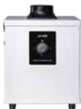
Smoke Purifier AF150

Thanks to the three-stage filtration system, the devices remove up to 99.97% of these particles. The filtered air can then be safely returned to the room.