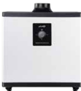
Smoke Purifier AF200